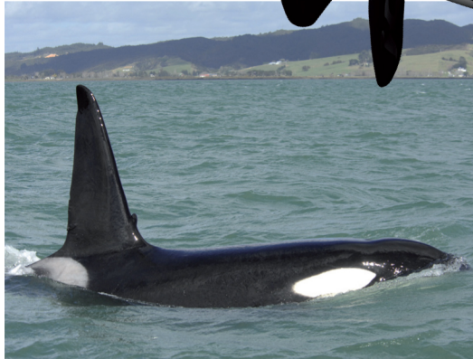
Above: Nobby in Whangarei Harbour

MOST RECENT RESIGHTING: Kaikoura (South Island)