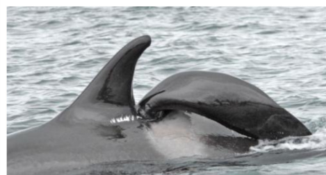
BEN'S CUT DORSAL FIN.