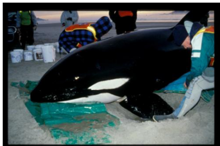
DIGGING OUT BEN'S PECTORAL FINS.

Visser, I. N. & Fertl, D. C. (2000) Stranding, resighting and boat strike of a killer whale ( Orcinus orca ) off New Zealand. Aquatic Mammals 26(3): 232-240.